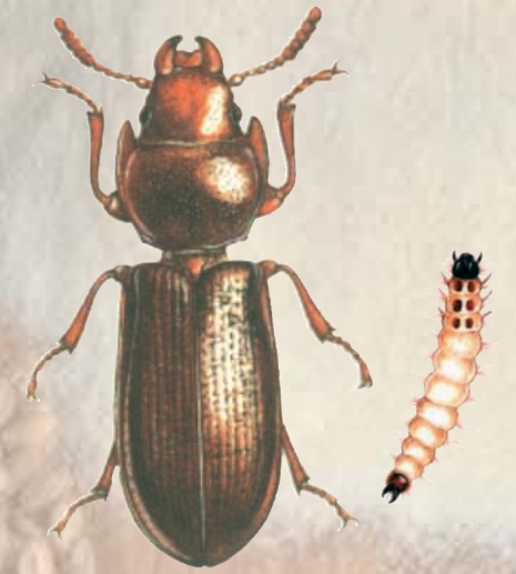
Tenebroides mauritanicus (Cadelle Beetle)