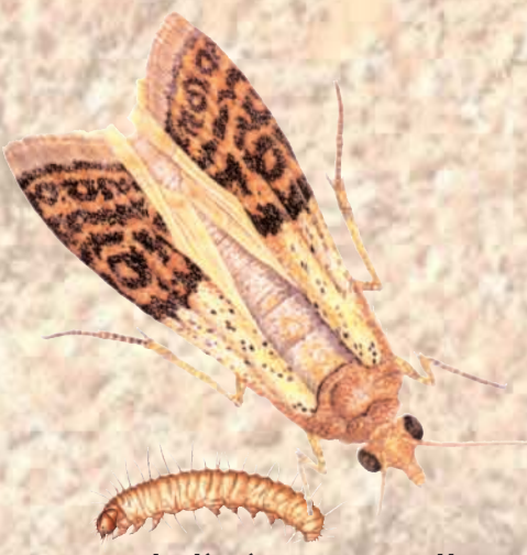
Plodia interpunctella (Indian Meal Moth)