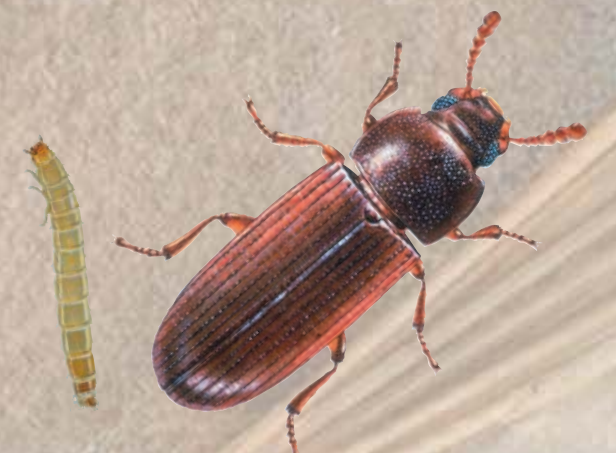
Tribolium castaneum (Red Flour Beetle)