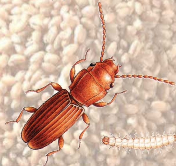
Cryptolestes ferrugineus (Rusty Grain Beetle)