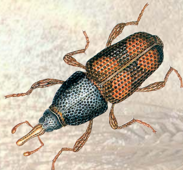
Sitophilus oryzae (Rice Weevil)