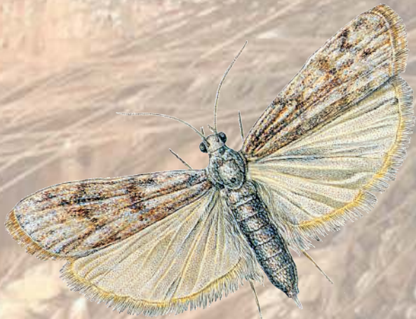
Ephestia kuehniella (Mediterranean Flour Moth)