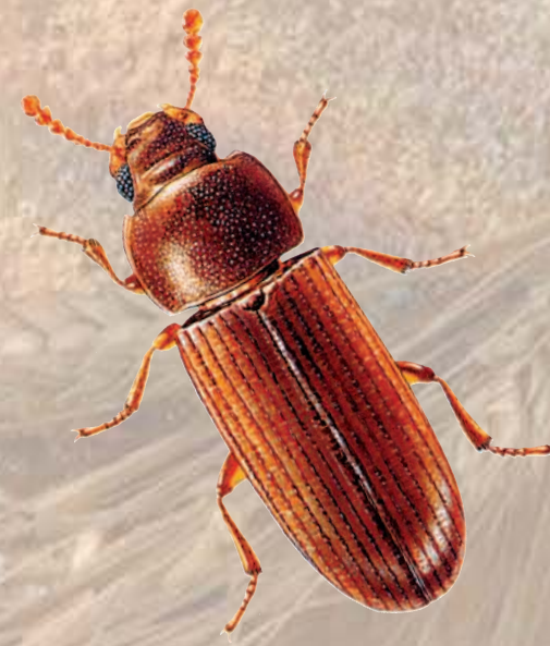
Tribolium confusum (Confused Grain Beetle)