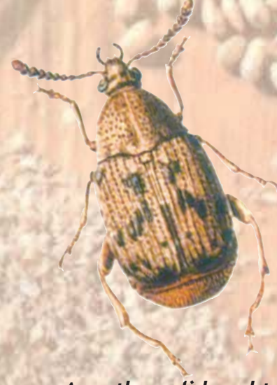
Acanthoscelides obtectus (Common Bean Weevil)