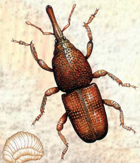
Sitophilus zeamais (Maize Weevil)