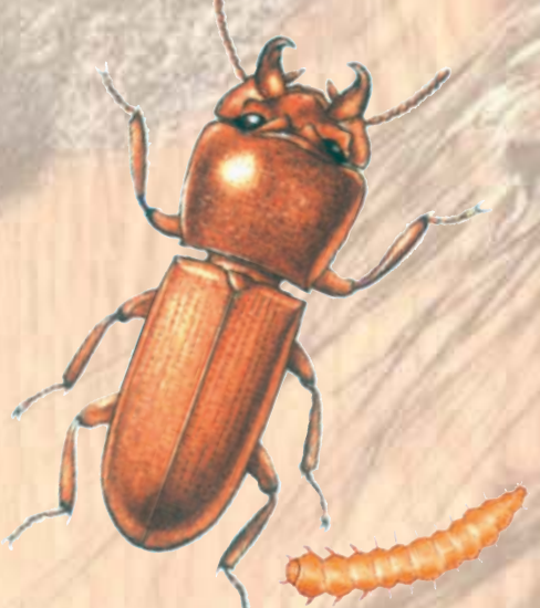
Gnathocerus cornutus (Broad-Horned Flour Beetle)