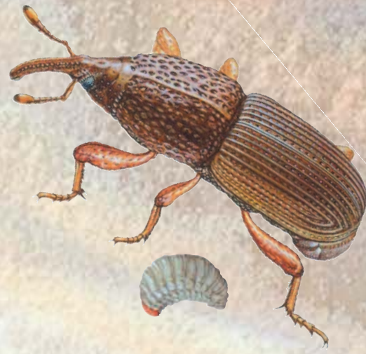
Sitophilus granarius (Granary Weevil)