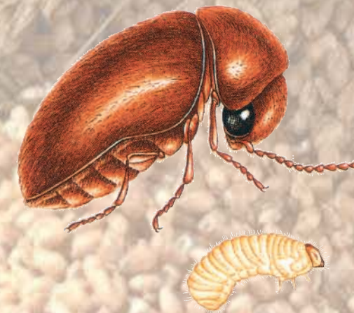
Lasioderma serricorne (Cigarette Beetle)