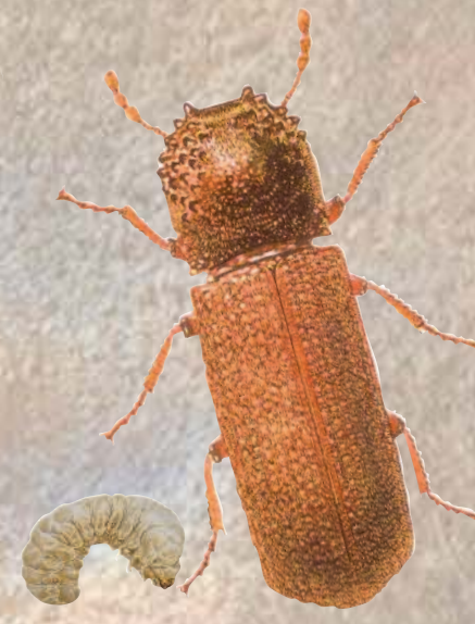
Rhizopertha dominica (Lesser Grain Borer)