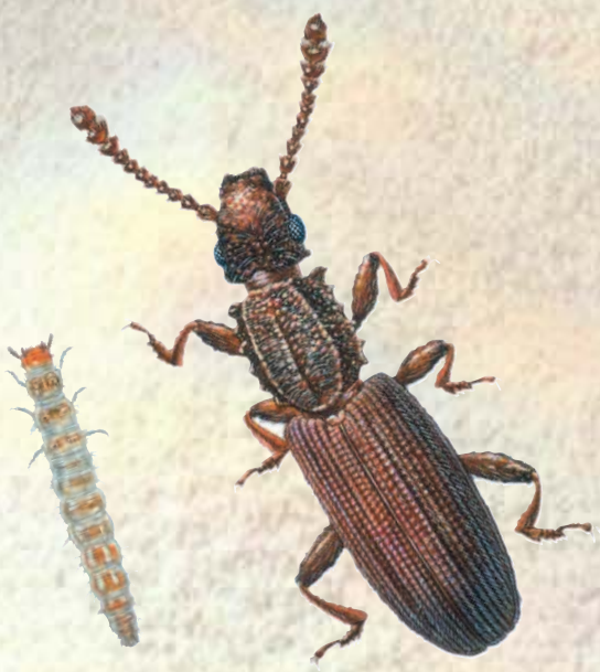
Oryzaephilus surinamensis (Saw-Toothed Grain Beetle)