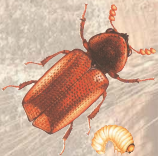
Prostephanus truncatus (Larger Grain Borer)