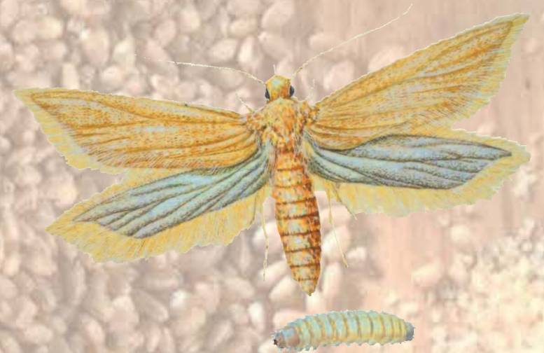
Sitotroga cerealella (Angoumois Grain Moth)