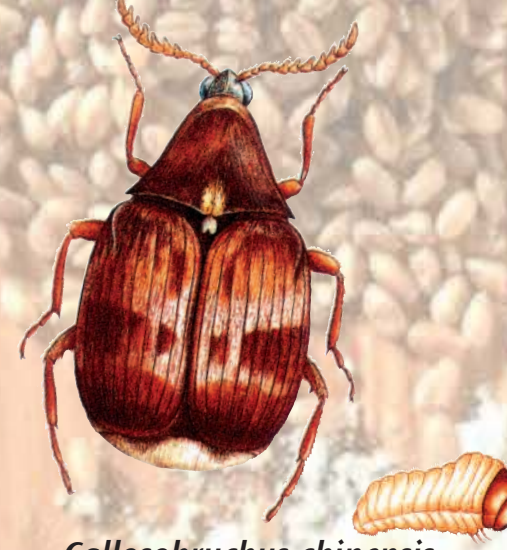
Callosobruchus chinensis (Cowpea Beetle)