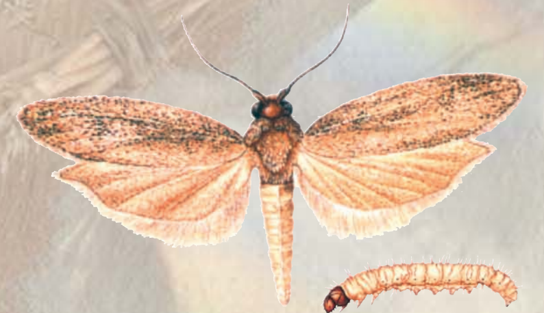
Corcyra cephalonica (Rice Moth)